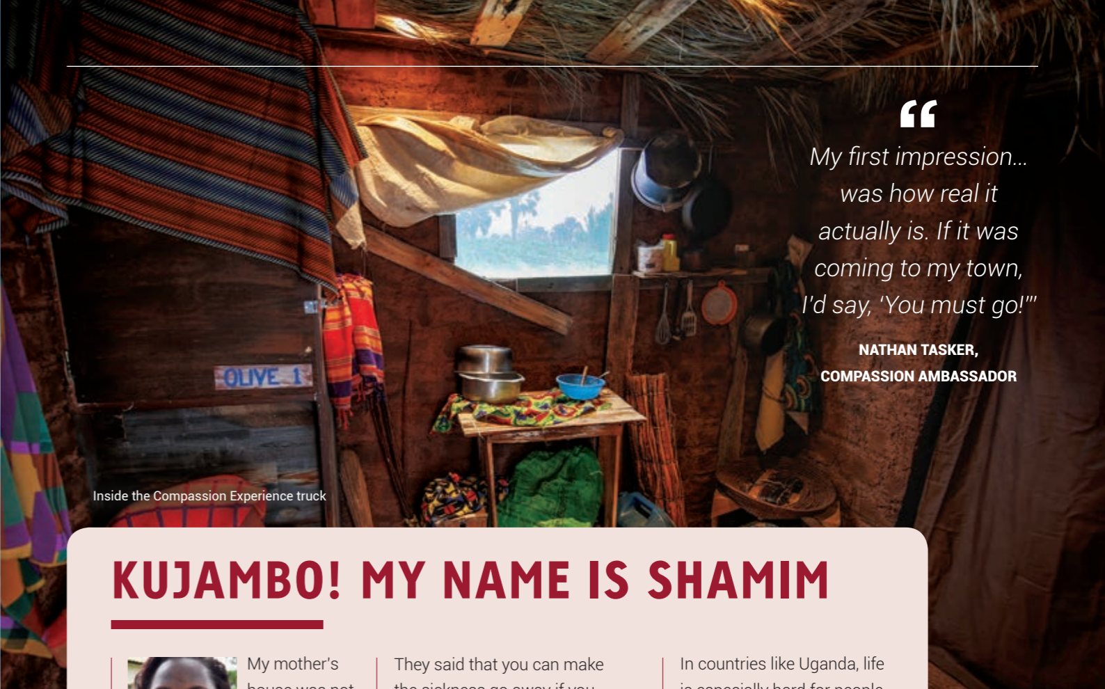
Inside the Compassion Experience truck