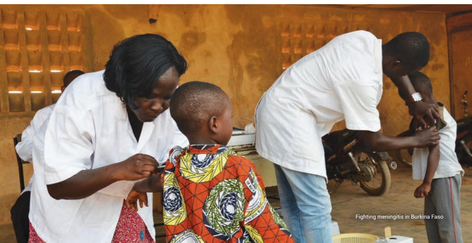
Fighting meningitis in Burkina Faso

Prevention is the best avenue to good health and best started young. The children are taught about a range of hygiene practices including how to brush your teeth, wash your hands, and how often to take a shower.