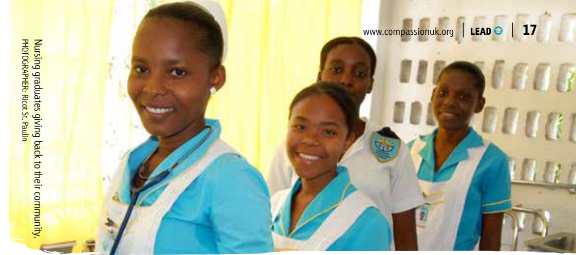
Nursing graduates giving back to their community.