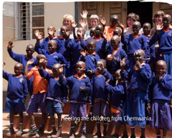
Meeting the children from Chemwania.

St James' Church, Abinger, has been partnering with Compassion for five years. With an average congregation size of just 15-20, they sponsor an incredible 40 children, mostly from the Compassion project run by Chemwania Anglican Church in Uganda. From Abinger to Chemwania, the leaders of these two churches have been sharing how partnering with Compassion has impacted their local communities: