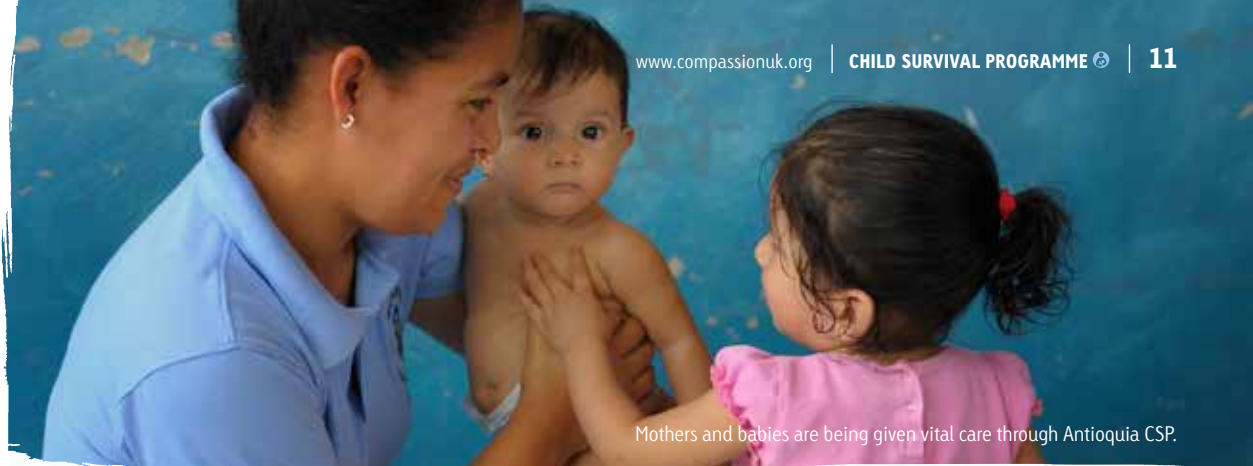
Mothers and babies are being given vital care through Antioquia CSP.

Last year at New Wine, we asked people to sponsor a child in the same village so that we could transform the whole village. It's a beautiful model. We're telling kids, "We don't just see your village, we see you. You matter to us. You're not invisible anymore, we've named you, and we've called you our own." It's exactly what God has done to each of us. cm