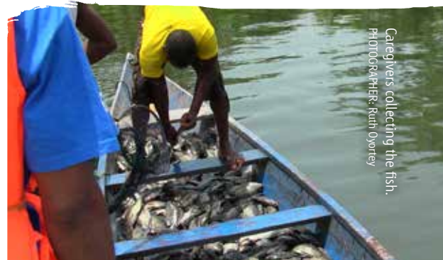
Caregivers collecting the fish.

After receiving funding from Compassion UK, the project created a tilapia farm. Using two locally built aqua cages and a canoe, the caregivers of the project were able to raise 16,000 young fish to maturity, resulting in a harvest of 2.3 tonnes. The meals at the project were supplemented with the tilapia and the rest were sold at market. With the profits, caregivers were paid and another aqua cage and more fingerlings were purchased. The project has a five year plan to expand the farm to 25 aqua cages and create an onsite hatchery to become entirely self-sufficient.